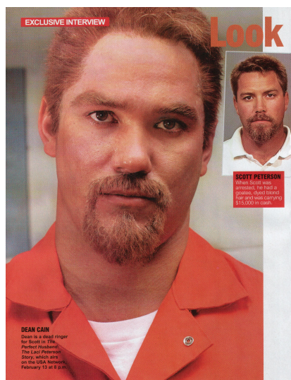
DEAN CAIN Dean is a good finger for Scott in The Perfect Husband . The Lois & Clark Story, which airs on the USA Network February 13 at 8 p.m.